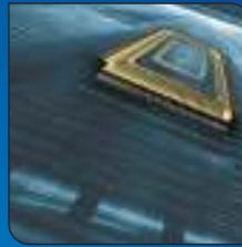
Fast and accurate weighing