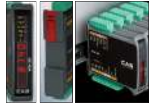
Front Back Mounted to DIN rail

WTM-300 series is mountable to DIN rail that suitable for back panel of weighing system ; space-saving vertical shape