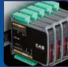
DIN rail mountable type